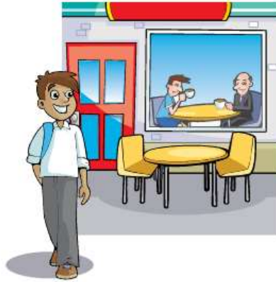
Robert's favourite restaurant