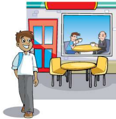
Robert's favourite restaurant