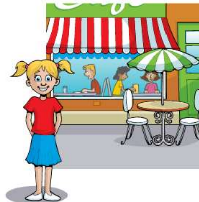
Sarah's favourite restaurant